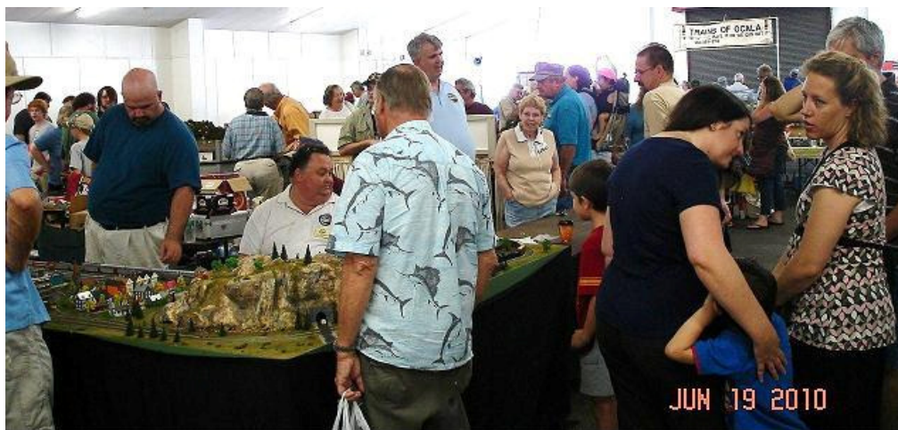
Railroaders crowd the floor at the 19th Annual BBMRA Show!

And, if the dealers' offerings weren't enough for railroaders to gorge on, all together there were 11 operating layouts on the show floor. BBMRA was well represented by five different scale model layouts including Large, Small (N), HO, Z, and G Live Steam. Also, the club Switching Layout challenged and entertained a multitude of children and some adults throughout the 7-hour show. Thomas the Tank, a G Scale playing typical carnival music and a large colorful Lego display were other crowd pleasing attractions.