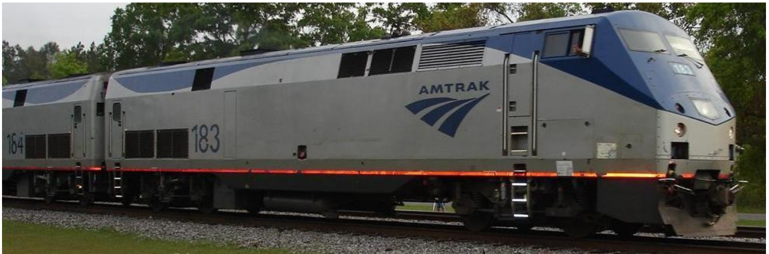
Amtrak powers Auto Train through Folkston Funnel

On a cool, picture-perfect day amongst congenial railfans chatting and exchanging pleasantries, taking photos and filming videos we were amazed to see a total of 24 trains during the time we were in Folkston. The final tally of train types numbered two coal drags – one empty and one loaded; two open "gons" filled with road gravel; seven intermodals – one a dedicated "military"; one 70-car long auto carrier; seven mixed freights – five that rambled through the Funnel; and two powered by Norfolk Southern we encountered at the grade crossing on highway 121 in St. George, GA on the way to and from Folkston.